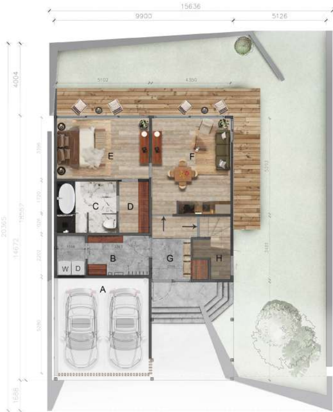
Ground Floor Indicative Plan