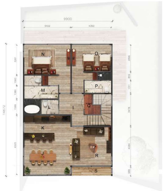
First Floor Indicative Plan